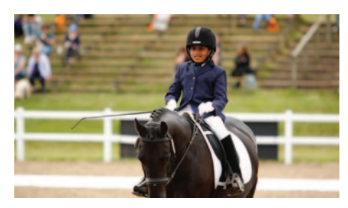
8 Paralympic hopeful Helping patients achieve their dreams