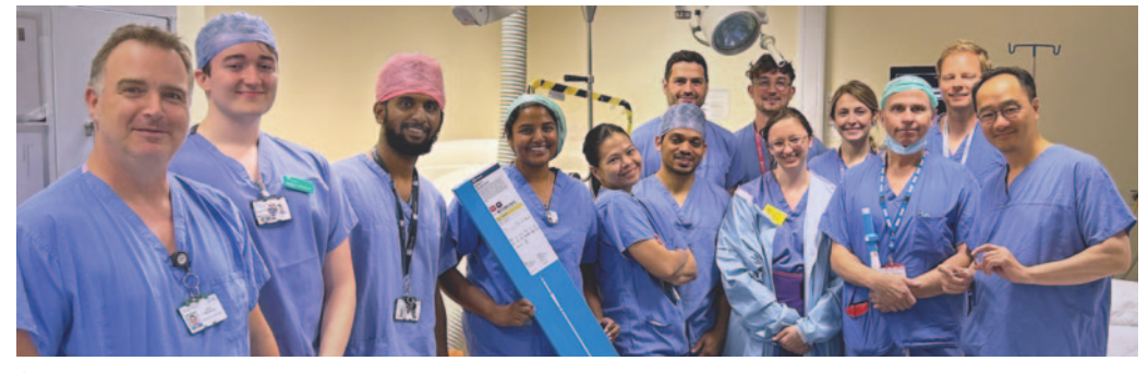
Staff at Royal Brompton Hospital

A new pacemaker system to treat patients with complex heart rhythm conditions has been successfully used for the first time in the UK at Royal Brompton and St Thomas' hospitals.