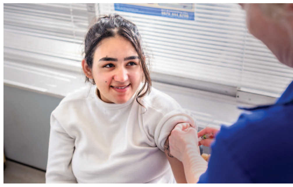
Getting vaccinated can help you to be 'winter-ready'

While some patients who are seriously ill with respiratory infections might need to be treated at A&E or an urgent care centre, the vast majority are likely to be better off seeking health advice or medication from